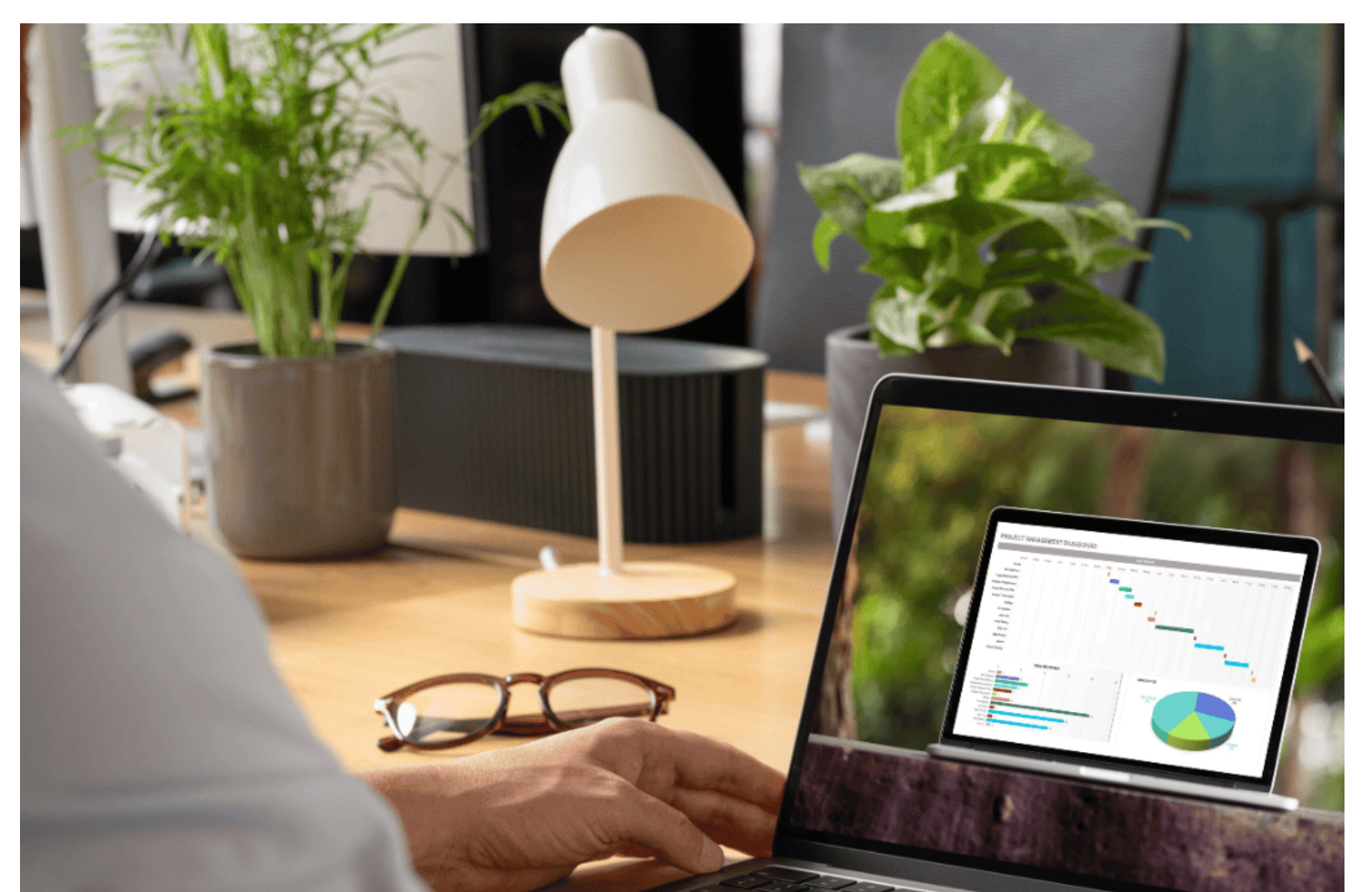
Environment and Ecodesign