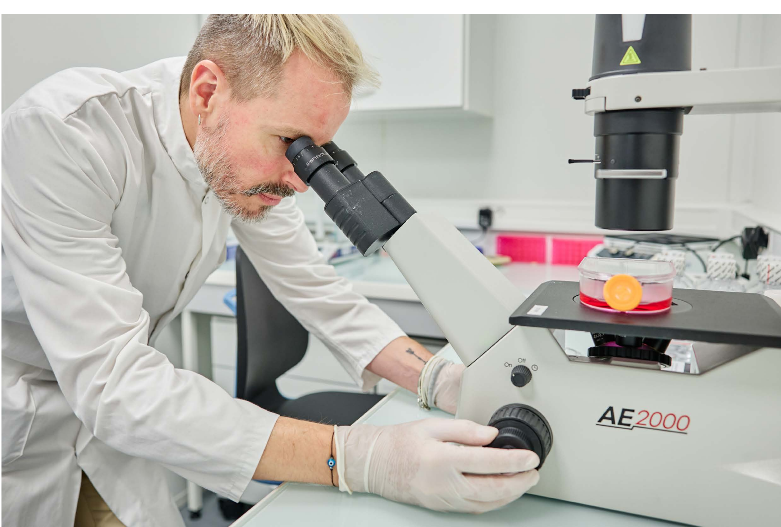
Nutrition Life Sciences